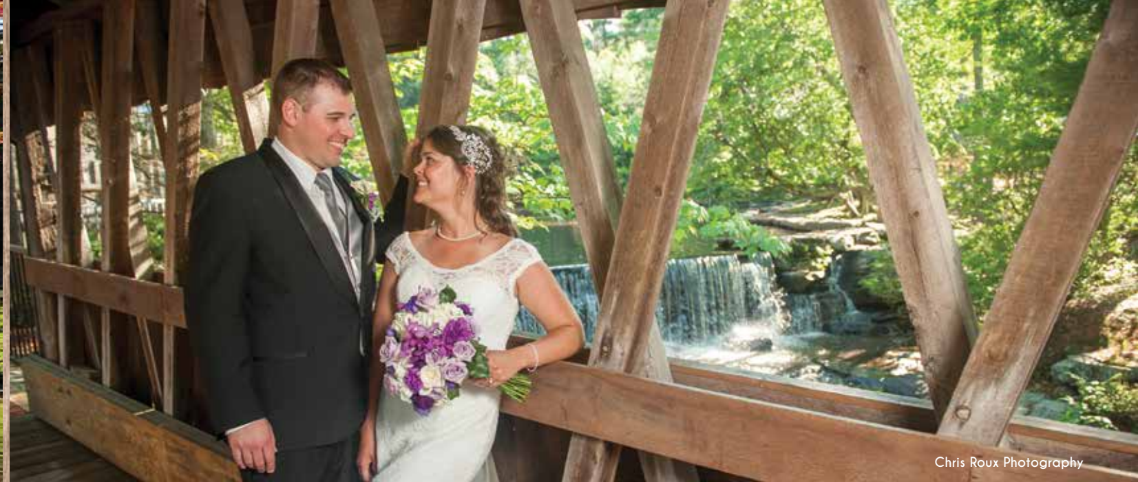
Chris Roux Photography