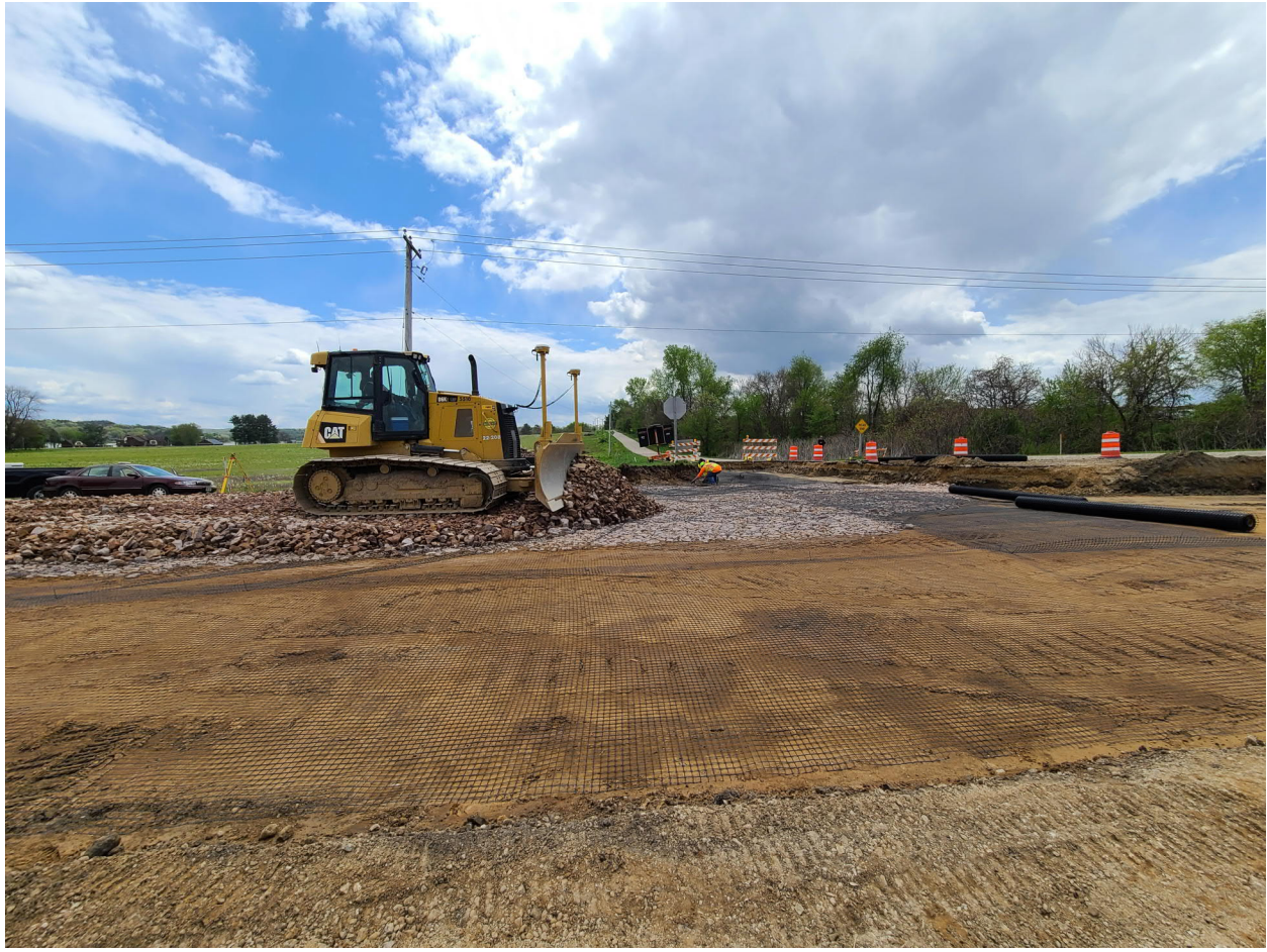
Placing select crushed material at Idlewild Road intersection, (5/6/21)