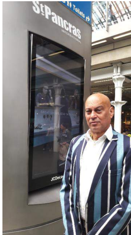
The Goa Constrictor