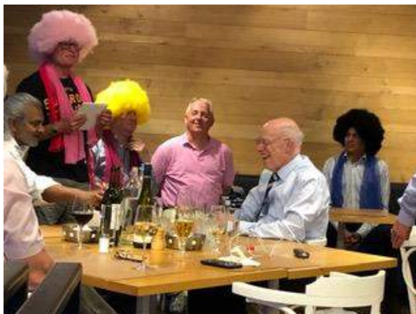
In the Courtroom

He endeavoured to smear the Supreme Commander's reputation with every wrong thing he could think of. Happily, the Supreme Commander was not deemed sufficiently guilty as to warrant the sentence handed to poor Admiral Byng RN in a previous century: he was executed 'pour encourager les autres'.