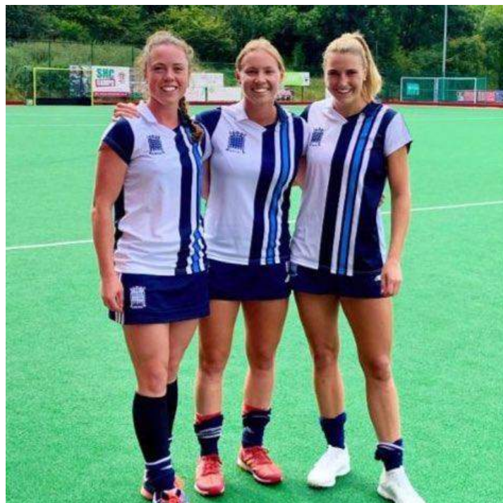
H&W's GB international trio

Women’s 1 st XI v University of Birmingham at 1530h