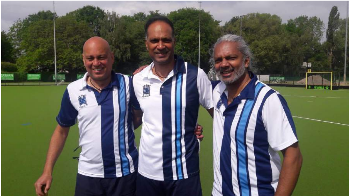
The Goan Brethren

Our Temse hockey friends even ferried us back to Bornem after dinner, where some extra late-night training was added to the schedule. After over-exertion by some late on, our second match against the Belgian Old Lions on Saturday morning was not our best and is best forgotten.