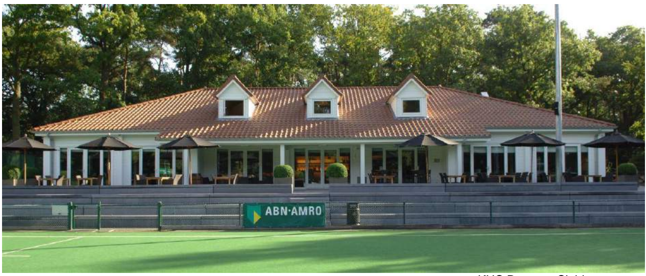
KHC Dragons Clubhouse

In the Men's 60+ competition, the top three ranked teams were England the Netherlands and Scotland. In the final, England defeated the Netherlands 3-2 and in the 3<sup>rd</sup> v 4<sup>th</sup> places match, Scotland beat Germany 4-3.