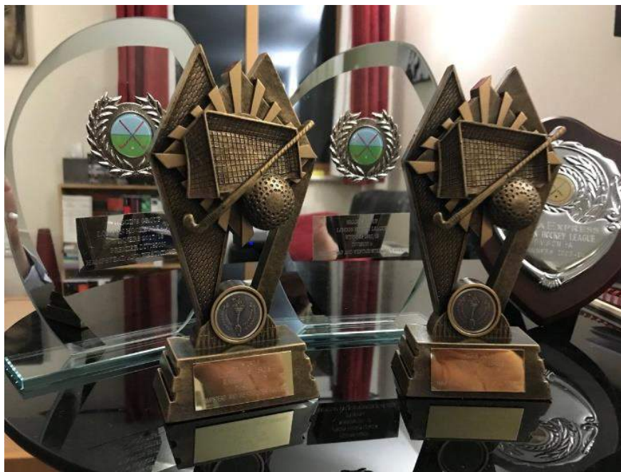
Hampstead's trophy haul in the London League