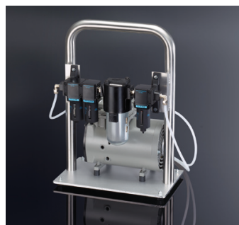
External pump with filter and air dryer unit for pressure and vacuum