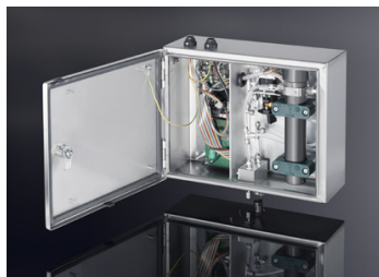
PAMAS OLS4031 in stainless steel shell

The standard shell is made of coated steel. For Phosphat-Ester applications, the PAMAS OLS4031 is manufactured with a special stainless steel shell that protects the housing from corrosive liquids.