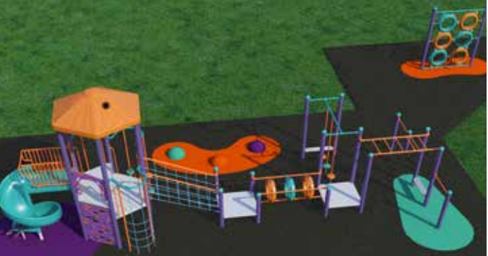
Artists Impression of the new playground