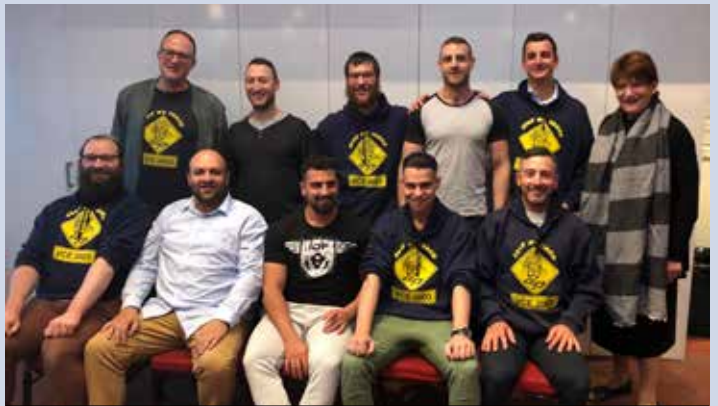
Class of 2003 Yeshivah reunion attendees unearthed their VCE school jumpers and enjoyed the chance to catch up with old friends and reminisce.