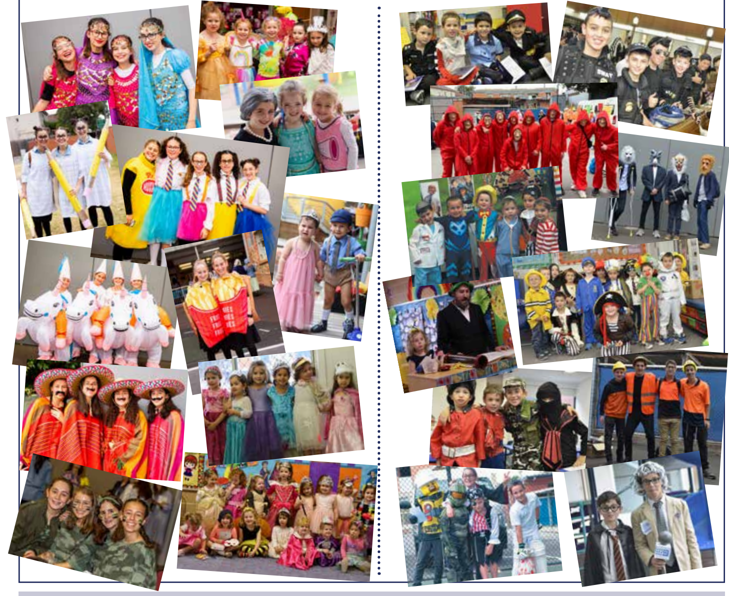
A Look Back at Purim Through the Years

Another spectacular Purim at YBR! An incredible 12 Megillah readings across the campuses, costume parades, matanos laevyonim and swapping shaloch manos! Thanks to all the parents who joined in the fun and dressed up in the Purim spirit!