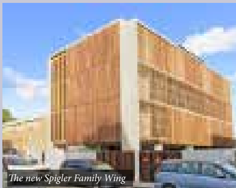
The new Spigler Family Wing

Thank You to all our donors, supporters and partners in this wonderful facility.