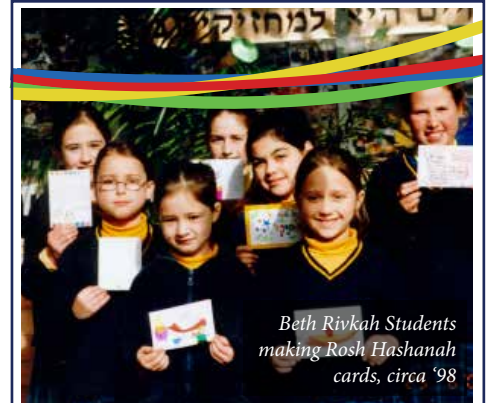
Beth Rivkah Students making Rosh Hashanah cards, circa '98