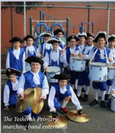
The Yeshivah Primary marching band entertains