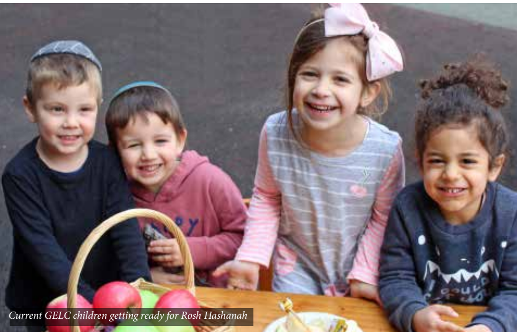
Current GELC children getting ready for Rosh Hashanah

Wishing you and your family a Shana Tova U' Mesukah!