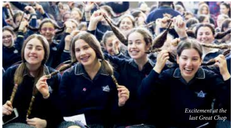
Excitement at the last Great Chop

Donations to this worthy cause are still being accepted via https://chuffed.org/project/the-great-chop .