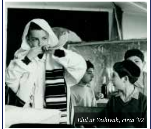
Elul at Yeshivah, circa '92