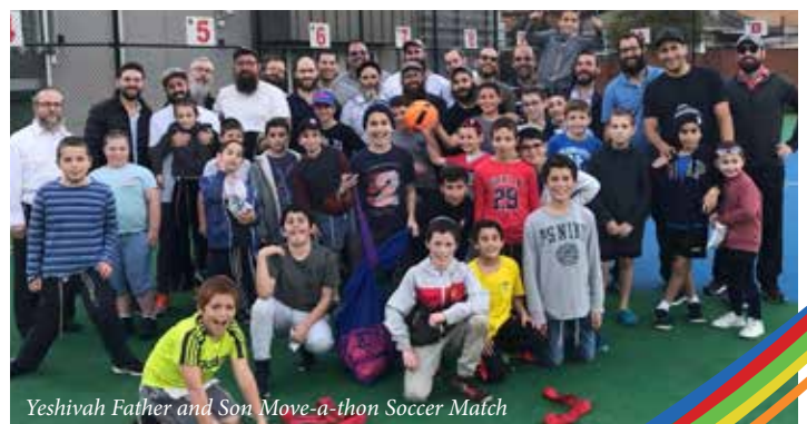
Yeshivah Father and Son Move-a-thon Soccer Match