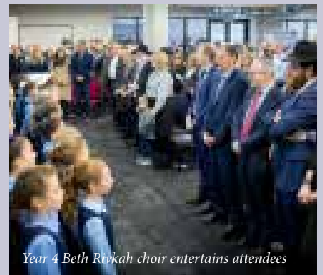
Year 4 Beth Rivkah choir entertains attendees

We look forward to hosting another enjoyable YBRPA End of Year Carnival for YBR students at the close of the 2018 school year. We are seeking volunteers and contributions toward the event. Please contact us via parents@ybr.vic.edu.au if you would like to assist.