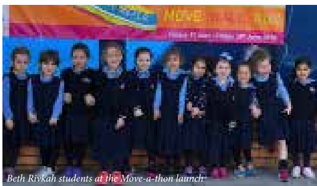
Beth Rivkah students at the Move-a-thon launch