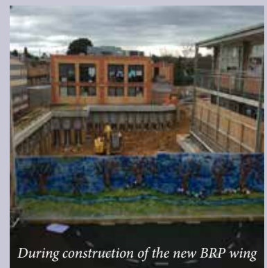
During construction of the new BRP wing