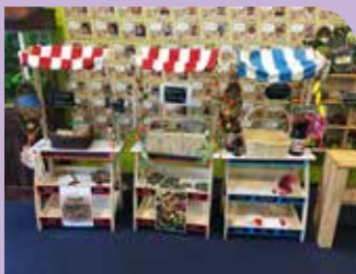
↑ Machane Yehuda