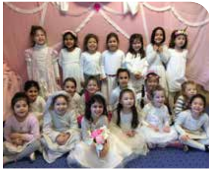
↑ Kinder 3 Brides