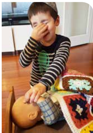
↑ Each week one member of Kinder 7 gets to take home Mitzvah Menchie.