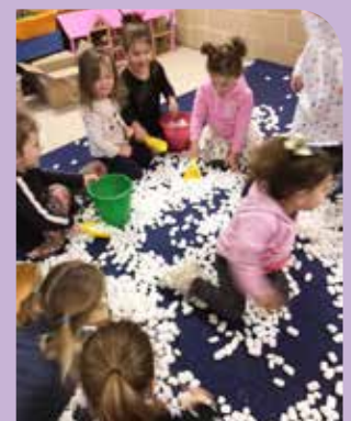
↑ Snow play in Kinder 5