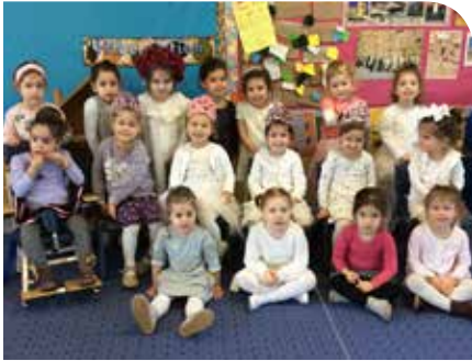
↑ Kinder 2 girls dressed up for Tu B'Av

Tu B'Av is one of the most joyous days in the Jewish calendar. Many important things occurred on this day. We learned how the girls would dance in the vineyards all wearing white dresses. Many girls found their "chattanim" (grooms) on this day! The children in the Gurewicz Early Centre all came together and danced on the playground to celebrate this happy day.