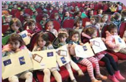
↑ El Al Flight - GELC613 off to Eretz Yisrael