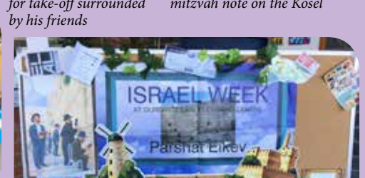
↑ Israel Week