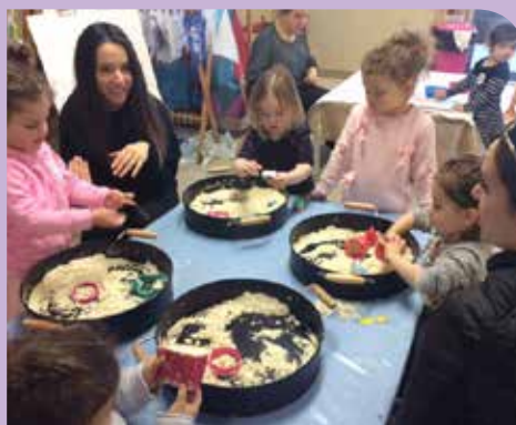
↑ Playing with snow made from flour and baby oil