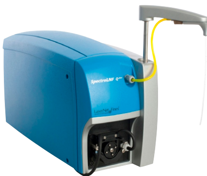
LaserNet Fines Q230 Series