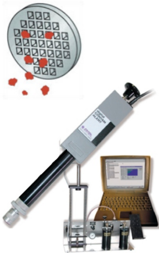
Rockwell digital CONTAM-ALERT