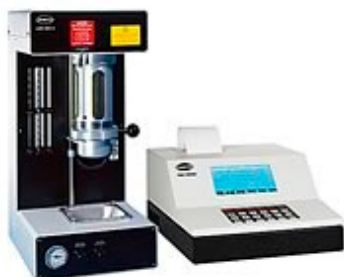
HIAC ROYCO 8011 OPC

Traditional light blockage particle counters have several inherent design limitations. The photo detector results contain measurement errors caused by the presence of water and air bubbles within the oil sample. Properly preparing your sample by using ultrasonic agitation helps reduce the impact of air bubbles on particle count. For water containing samples (an oil sample that is 'milky' contains water), it is common to need 'water stripping' solvents to get a more accurate count. The presence of water results in a significant error in the reported particle count.