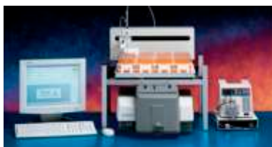
Thermo Fisher Nicolet FT-IR Spectrometer