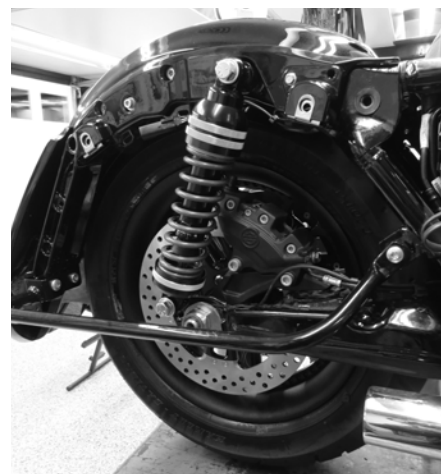
10 Here's the rear wheel on the bike with the new Progressive shocks and just-installed painted Paul Yaffe Bagger Nation rear fender.