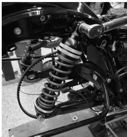
5 Back at Rob's shop, Dan is installing the Progressive Suspension 944 Ultra Touring shocks onto the bike.