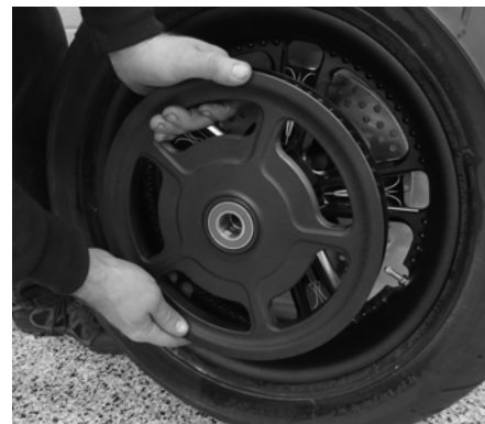
9 The blacked-out RSD rear pulley is then slipped into place on the RSD wheel.