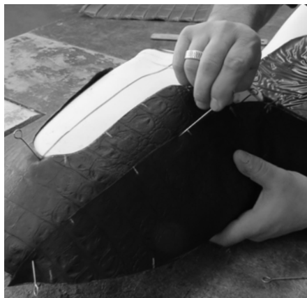
3 Matt then fits the black leather edging onto the seat.

Speaking of comfort, we took one of the most comfortable bikes in the world and made it better. Much of that is thanks to Matt Smith at New England Trim & Customizing in Shrewsbury, Massachusetts, who completely transformed the stock Harley seat. First off, he put a gel insert into the