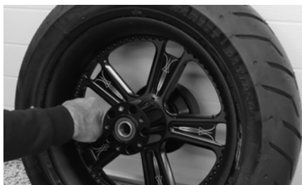
7 After Dan mounts the original Dunlop rubber to the new RSD hot rod-inspired, Black Ops Judge rear wheel, he tops off the tire pressure. Note the pattern Schlos put onto the wheel's spokes.