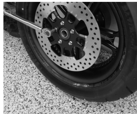
8 Dan then bolts the matching RSD Black Ops Judge rear rotor to the wheel using chrome hardware that we also got from RSD.

rider's section for sore butt prevention. Then he really let his talent fly by upholstering it with black leather and brown snakeskin. Yes, it's okay to flip back to the feature story for another look. I can't take my eyes off it, either. Additionally, a pair of 944 Ultra Touring shocks from Progressive Suspension improves the big bike's riding dynamics. Utilizing Progressive's FST