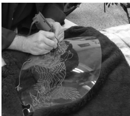
6 Steve "Schlos" Schlosberg is also at the shop engraving the new H-D 10" clear windshield we got for the bike.