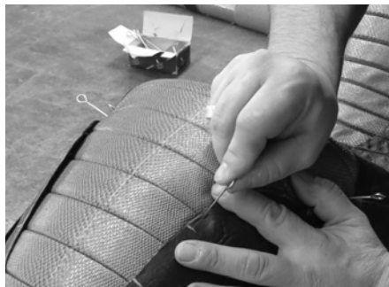
4 The snakeskin insert goes on next. Be sure to check out the finished seat in this issue's feature on the bike.