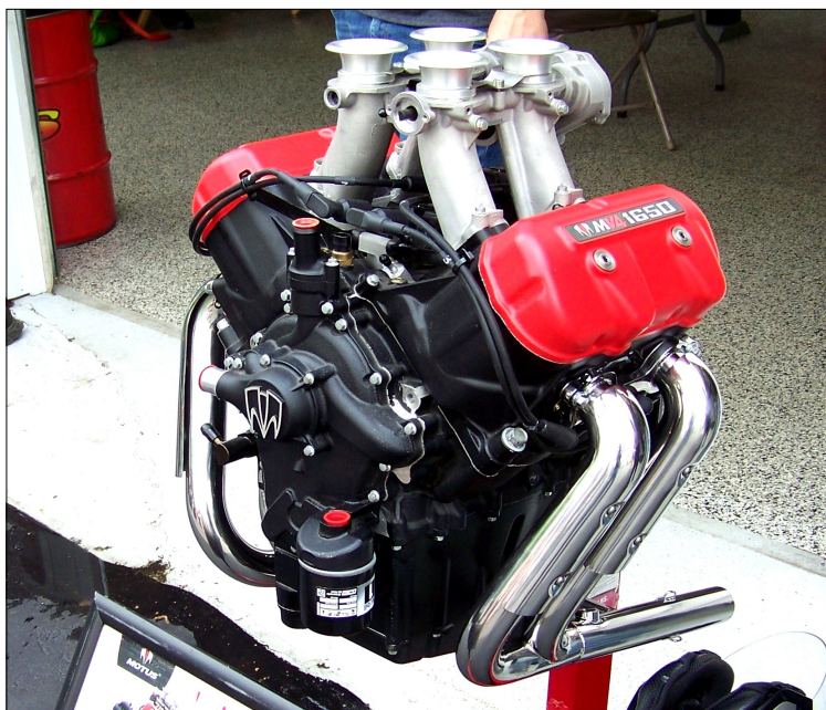
THE HEART OF THE BEAST V4 Baby Block, 1650cc, 165 hp, 123ft/lbs of torque.