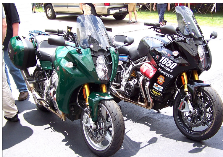
The Motus MST and the MSTR. One is just a little lighter, more powerful and faster than the other.