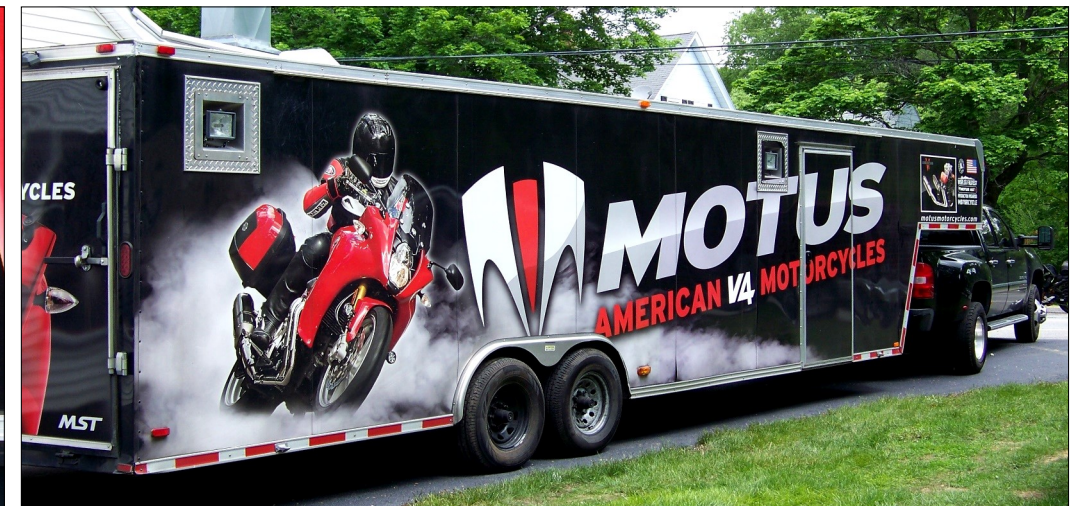
MOTUS American V4 Motorcycles. Made in Birmingham, Alabama.

cars parked along the street and they filled out the test ride roster quickly. There was also a few owners of the Motus that rode in with their personal bikes.