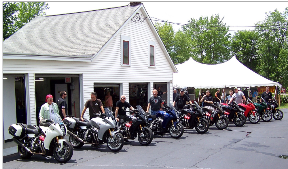
Ten Motus Motorcycles in a row, a few are already owned, a few are for sale and a few are test machines from the factory in Alabama. On the far end is Rob's personal bike. The red, green and blue machines were custom painted by their owners.

Rob had a good turn out as there were about 50 cycles and some