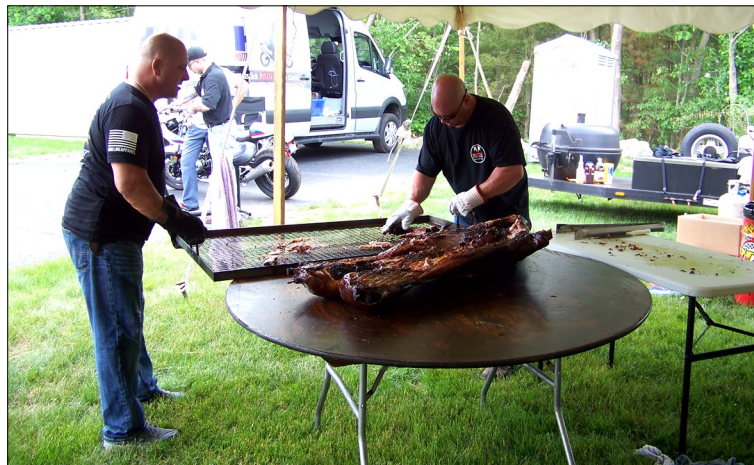
A smoked hog is perfect for feeding a large crowd.