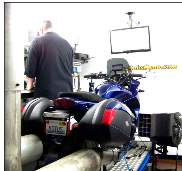
I captured the screen with 139 hp and 100 ft-lbs of torque, running at 135 mph using only 7271rpm's,