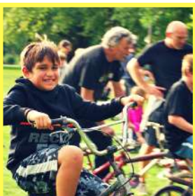
Noah & Co.