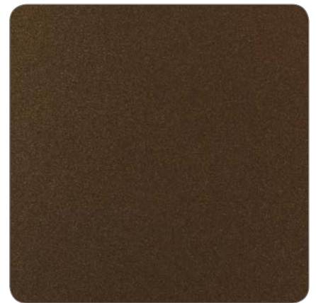
Y2217F Steel Bronze 2