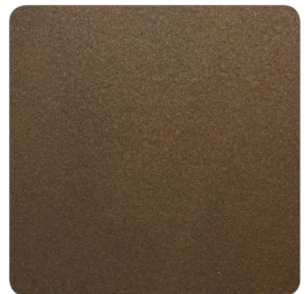
Y2214F Anodic Bronze