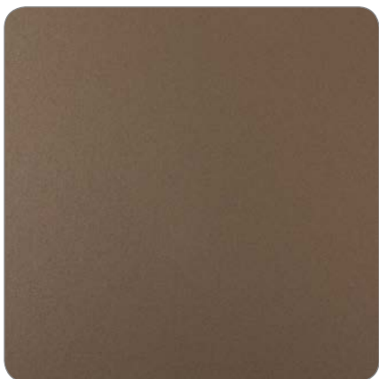
Y2204I Soft Champagne