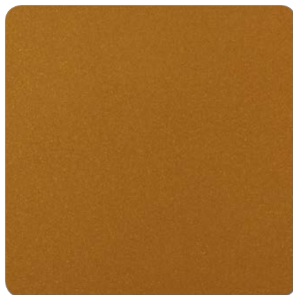
Y2205I Gold Splendour