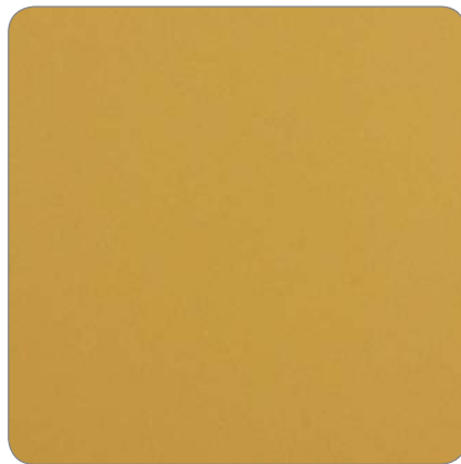
YY217E Gold Pearl