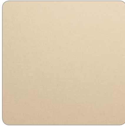
YW255F Golden Beach