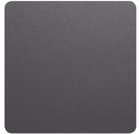
Y2215F Steel Blue Gray 715