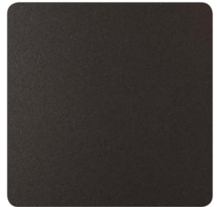
Y2207I Steel Blue Platinum