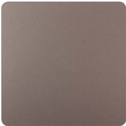
Y2203I Soft Silver