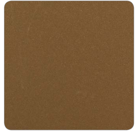
Y2206F Steel Bronze 1