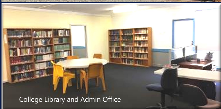
College Library and Admin Office

In September 2017, BCWA has moved its campus to Kelmscott Baptist Church, 29 Third Avenue, Kelmscott, WA 6111.