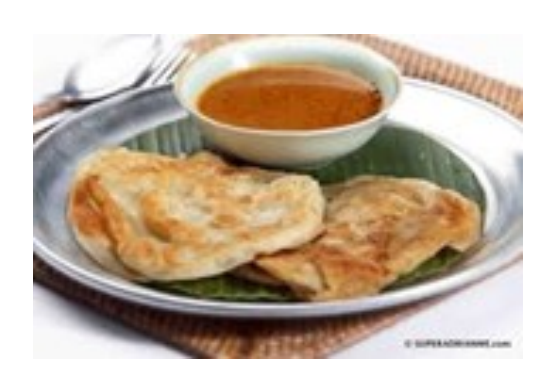
Praata & Chicken Curry