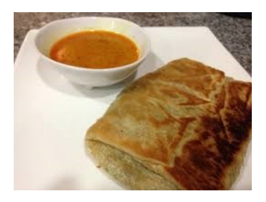
Murtabak & Vegetable Curry