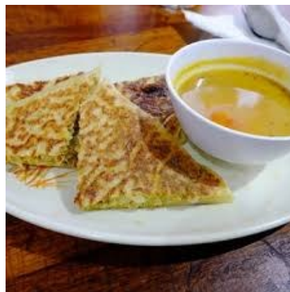
Murtabak & Dhal