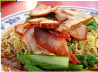
Chicken Rice & Kolo Mee