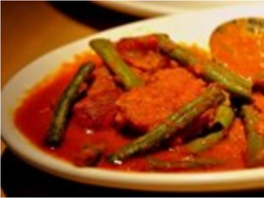
Fish Curry & Rice