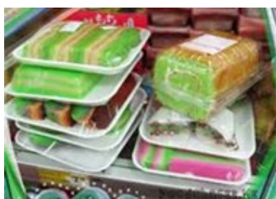
Cakes on Sale after the Lunch Service

Menu subject to change and pictures are for illustration purposes only Some dishes may contain peanuts