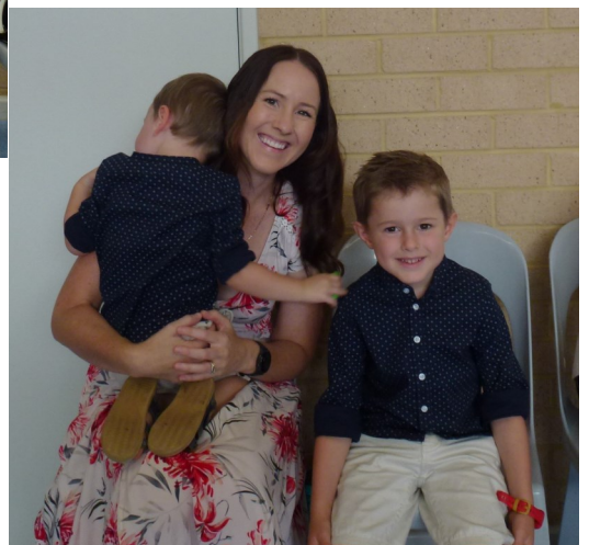
December 2021 Children's Xmas Party