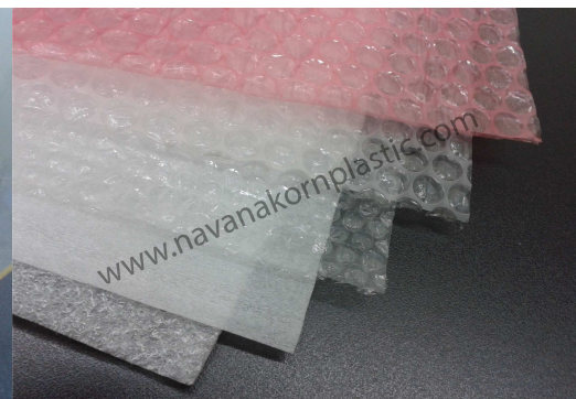
Air Bubble & EPE Foam