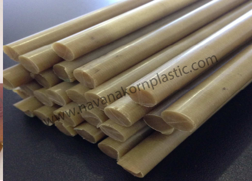
PAI / TORLON