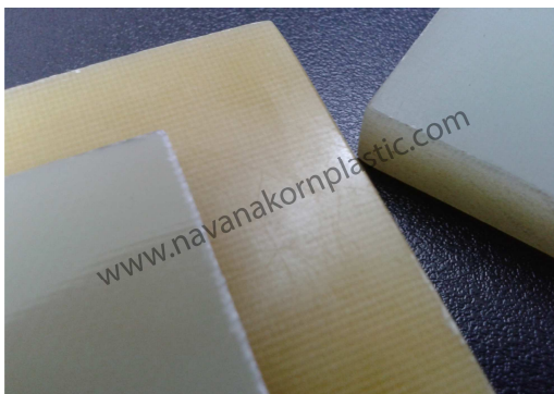
EPOXY G10 / G11