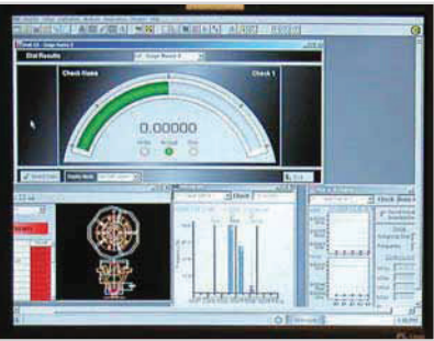
Multi-window display arranged by the operator's preference.

EPIC-ADAMM Touch's data and time specific performance records provide a reliable history of daily operations. Reporting outputs include the statistical analyses and standard deviations necessary to document quality and process performance. Data may be displayed using Statistical ProcessControl charts such as x-bar, range charts, histogram, scatter charts, ensuring consistency and compliance at every stage in the process.