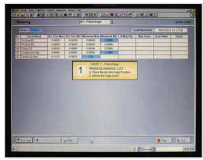
Automatic mastering prompts the user through calibration.