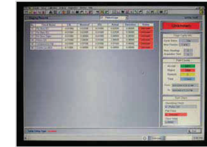
Counters and other managerial reporting features.