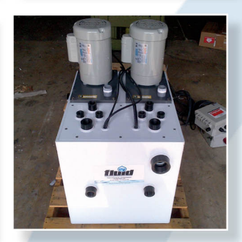
-Rectifiers -Heating Systems -Agitation Systems -Scrubbers -Control Panels -Ultraviolet Systems