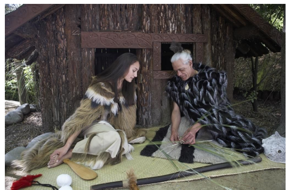
Couple at Whare