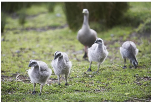
Cape Barron Geese

Family pass $125 (2 adults and up to 3 children) unlimited access for a whole year.