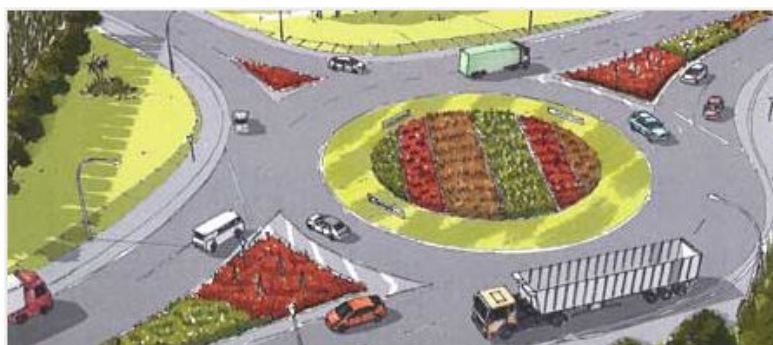
An artist impression of the Clearwater roundabout

Working in conjunction with the Western Bypass is the Western Corridor.