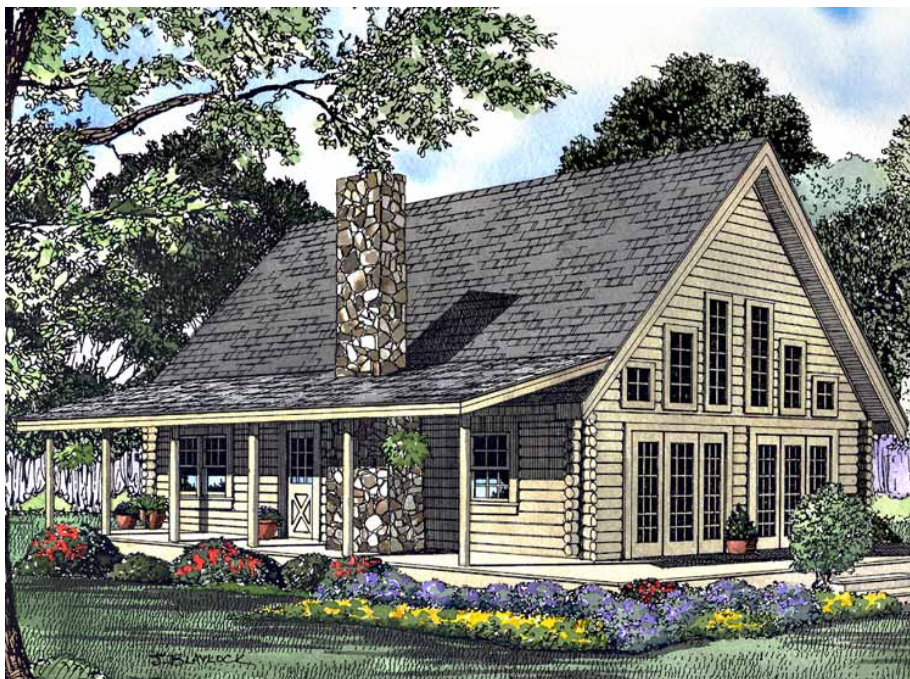
Arlington 147 m2. 1580 sq.ft. Supreme package $ 41.700 € 36.700