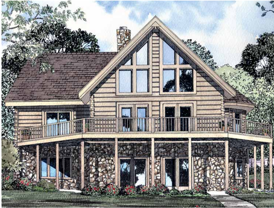
Litchfield 205 m2. 2200 sq.ft. Supreme package $ 79.000 € 69.600