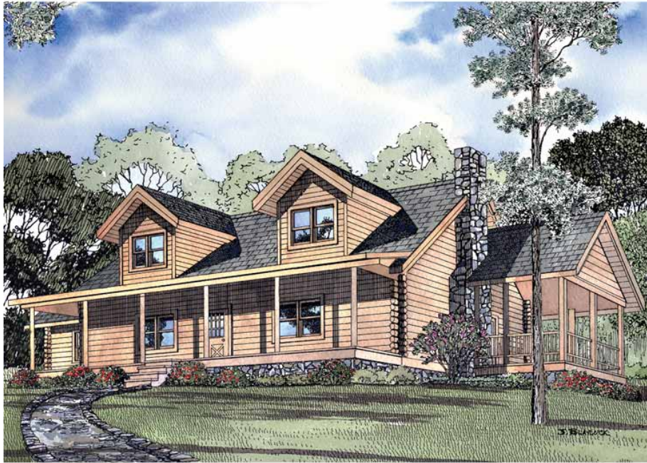
Cherokee 189 m 2 . 2035 sq.ft. Supreme package $ 54.500 € 49.500