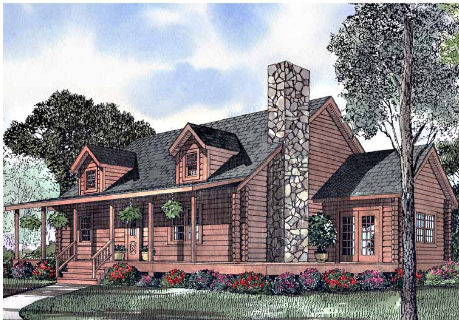
Pinehurst 170 m2. 1830 sq.ft. Supreme package $ 44.950 € 39.450