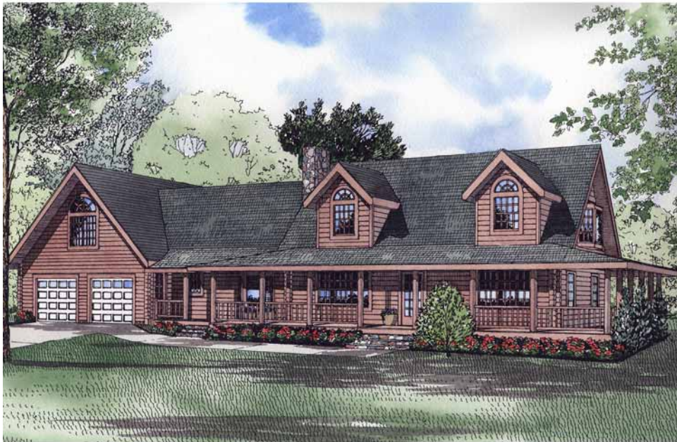
Mt. Mitchell 315 m 2 . 3400 sq.ft. including garage. Supreme package $ 105.300 € 92.700