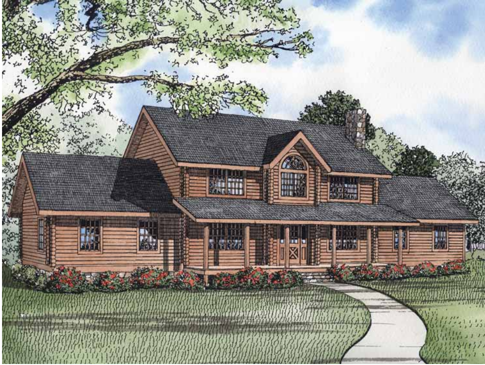
Asheville 240 m 2 . 2580 sq.ft. Garage 42 m 2 . 452 sq.ft. Supreme package $ 99.000 € 85.900