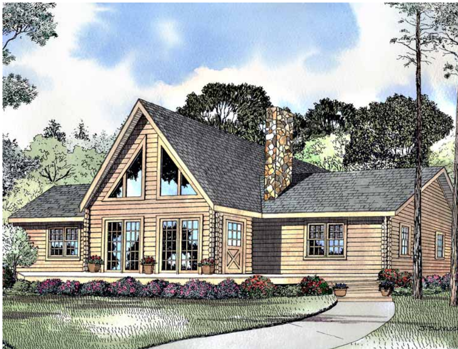
Whitehall s132 m 2 . 1420 sq.ft. loft 20 m 2 . 215 sq.ft. Supreme package $ 45.500 € 39.900

Our commitment to quality in every detail, eliminates the need for upgrades,, since we already included any possible upgrade in our standard package . However you may consider to opt. for cedar logs. Ask your sales rep. for a quote.