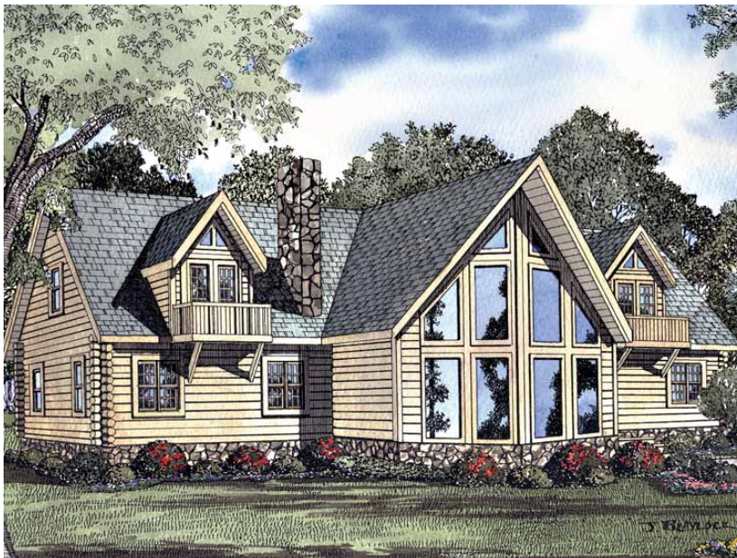
Sugar Mountain 260 m2. 2800 sq.ft. Supreme package $ 79.000 € 69.500